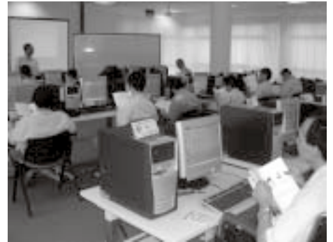
▲ Participants pay rapt attention in SPD's first Mandarin IT Literacy class.

For Chong Kuei Moi of the WAC, the computer is no longer a formidable object. She can now use it to type in different fonts, sizes and colours. A small step this may seem for many, but it was a definite headway for the physically disabled participants that day. ☺