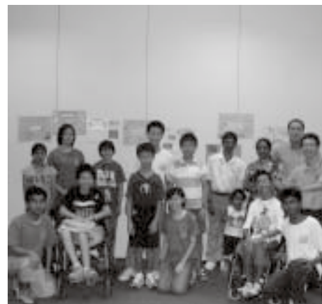
▲ The tourists on SPD's Holiday Getaway 2003